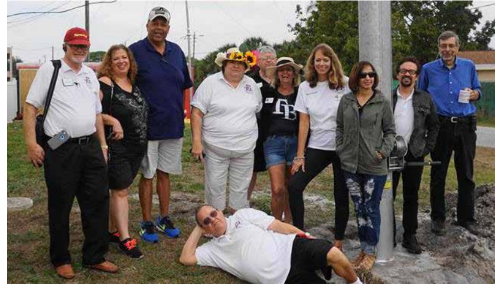
Volunteers work to make WKDW a reality.

Which brings us back to radio, both internet and FM. It is both a powerful tool to build community and a terrible weapon that can be used to destroy it. So, the quest becomes sacred in nature, do we build or destroy. It is a labor of love and we choose to build. Join us and check out WKDW 97.5 – the voice of the North Port Community, kdwradio.com.