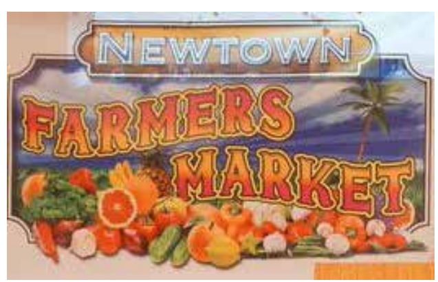
The Newtown Farmers Market operates the 1st and 3rd Friday and Saturday of every month. 1-6pm on Friday; 9:30am-1pm on Saturday.