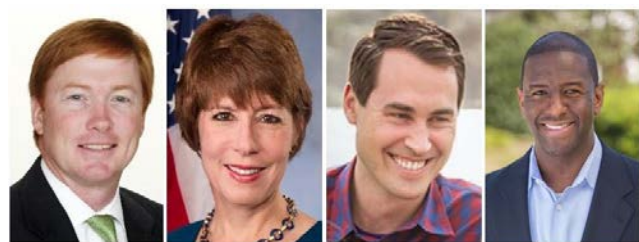
Republican Adam Putnam; Democrats Gwen Graham, Chris King, Andrew Gillum

The Florida Governor's race is up for grabs this year, as Governor Rick Scott is term limited and expected to jump into the race for US Senate. There will be a primary on both sides of the aisle, with Philip Levine and Gwen Graham leading the Democratic side (polling 12%), followed by Andrew Gillum (9%) and Chris King (2%). On the Republican side, Agriculture Commissioner Adam Putnam faces off against Ron DeSantis; Speaker of the House Richard Corcoran is also expected to run (recent poll numbers: Putnam 18%, DeSantis 16%, Corcoran 3%). Ron DeSantis, 39, has won the backing of President Donald Trump and billionaire donors across the country. DeSantis attended Yale and Harvard Law, becoming a decorated military lawyer who deployed with the Navy Seals in Iraq and was subsequently elected to Congress ($602,932).