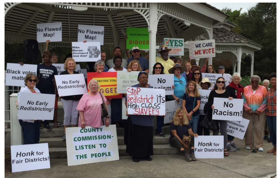
Citizens protest recent Sarasota redistricting.

City Council members from Venice, North Port and Sarasota opposed it. Despite evidence that the current districts were within the 10% "Safe survey to the public then disregarded the results,