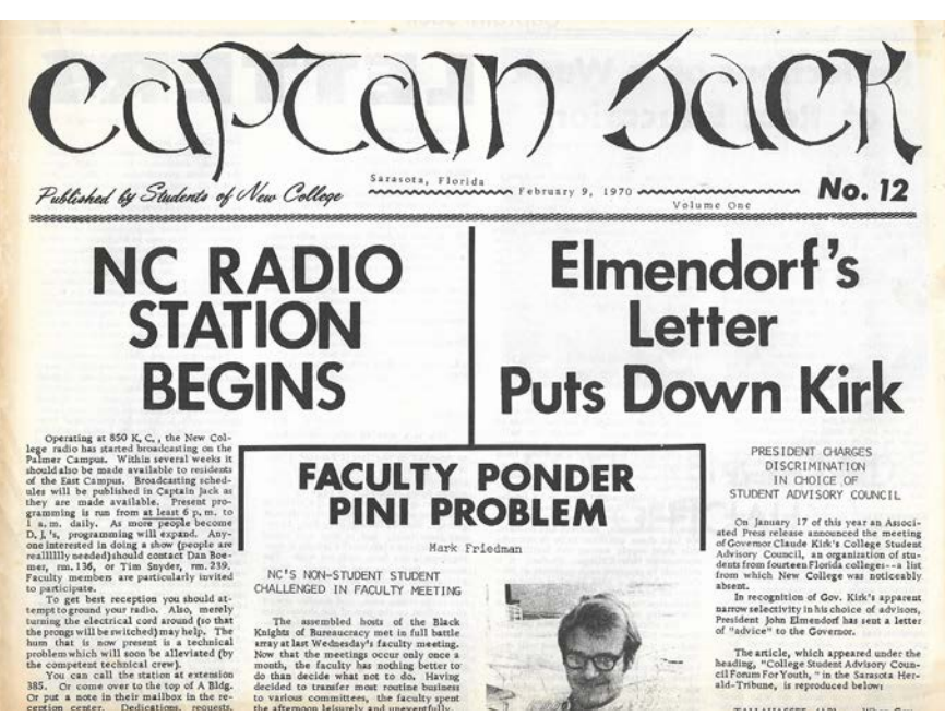
The student newspaper announces the start of WNCR in1970.

graduation. The location of the panel discussion has not been finalized but will be announced before the beginning of reunion weekend. This event is primarily for current students and alums.