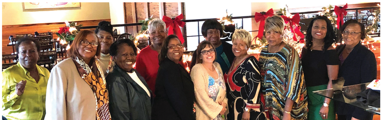
Suncoast Women of Action members gather for the holidays.