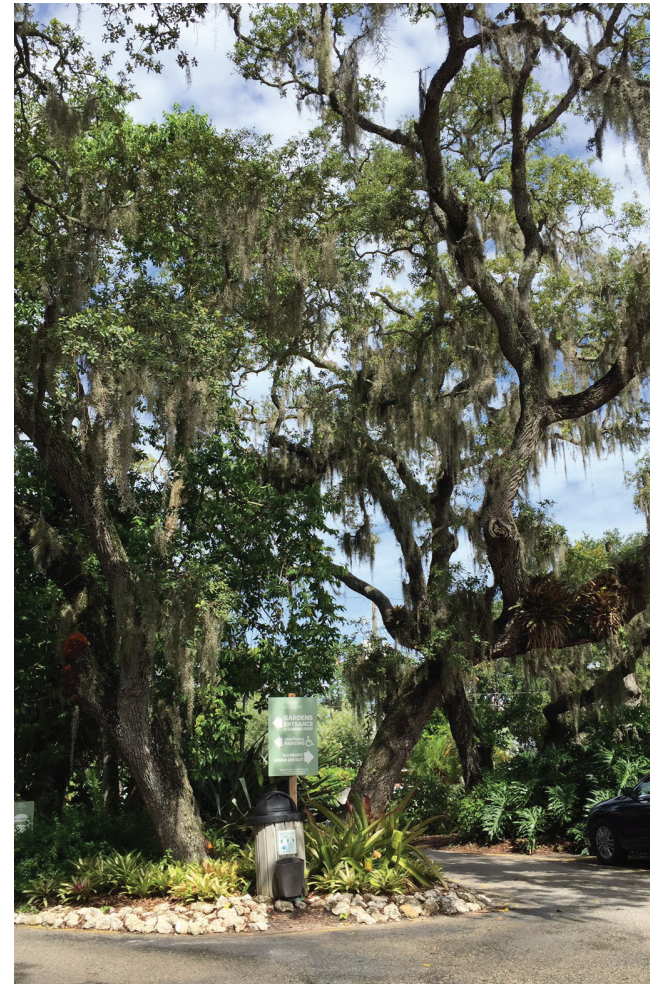
Oaks at Selby Gardens

from Marie Selby's expressed goal - to create a public garden? Because what's been proposed looks more like a event venue for Sarasota's elite, not to mention a grand oak graveyard.