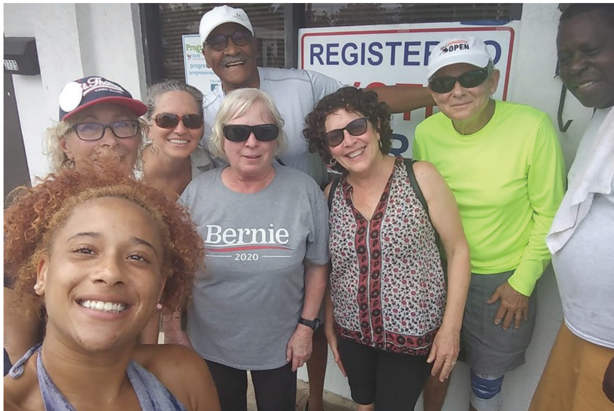
Progressive Sarasota volunteers register voters every Saturday from 12pm-4pm at Jetson's Creative Trends, 2741 N Osprey Ave.

Progressive Sarasota is staffing a Voter Registration Table and Canvassing every Saturday in the Newtown community. If you would like to volunteer, you can email: ProgressiveSarasota@gmail.com .