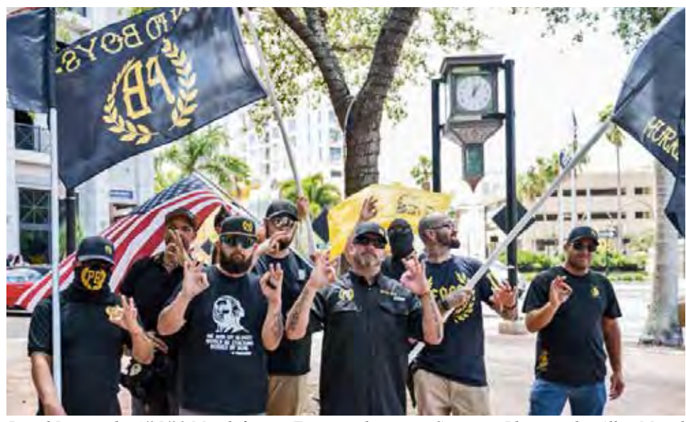
Vice President Pence Proud Boys at the 4/25/22 March for our Future in downtown Sarasota.

The true believers can fairly be described as extremists because they are not committed to democratic norms or principles. A hallmark of American democracy is abiding by election results. Even today, the extrevmists won't accept the presidential election results. In Florida, most