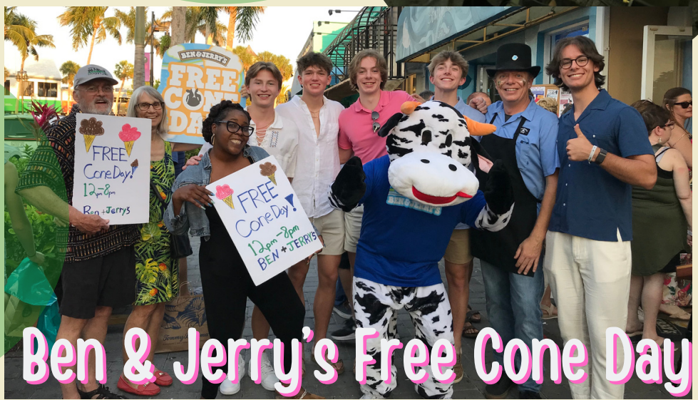
Ben & Jerry's Free Cone Day is an annual highlight for volunteers.