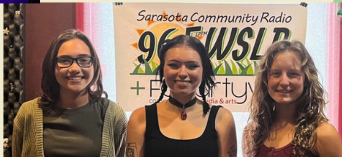
New College News Interns

Community Foundation of Sarasota: $8250 for website upgrade